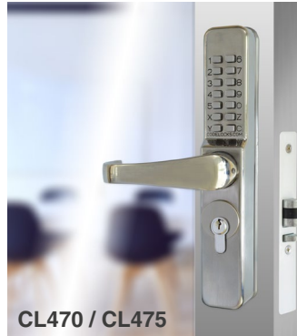
CL470 / CL475

Narrow stile Codelock complete with cams, threaded cylinder and lever handles.