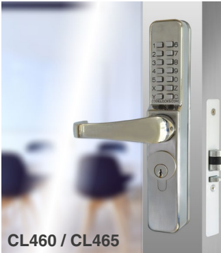
CL460 / CL465